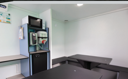
Spacious seating area