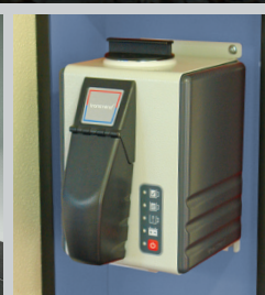
Hot drinking water system