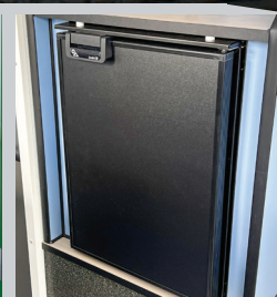
12V fridge (optional)

Innovative, functional, environmentally efficient and cost effective.